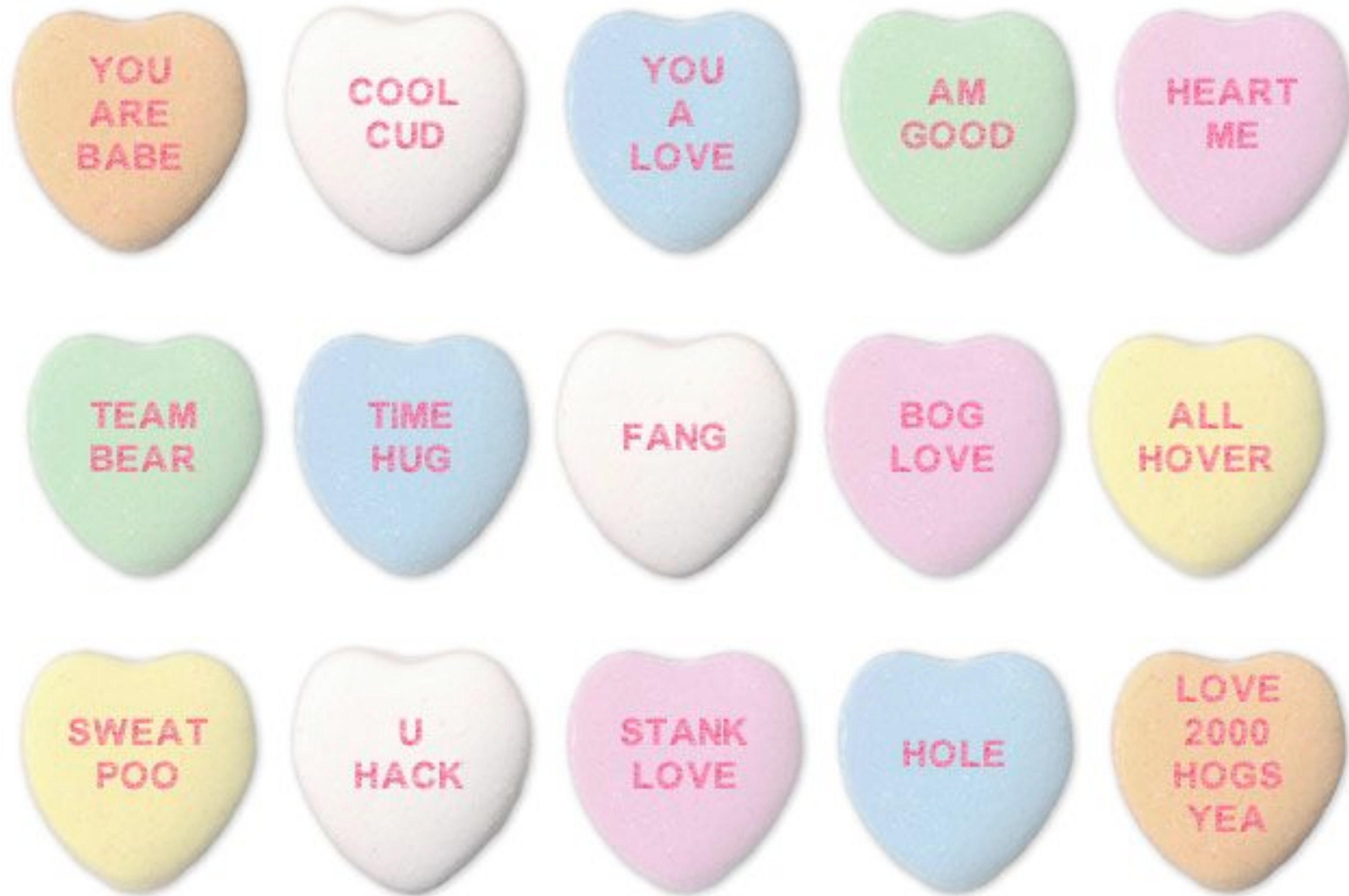
char-rnn, trained on 366 candy heart messages, AI Weirdness (2018)