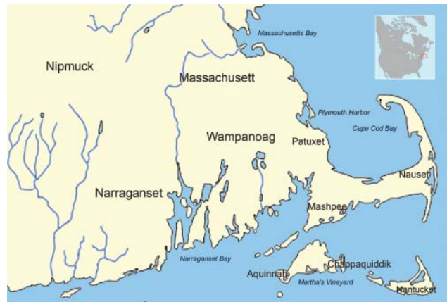
Figure 1. Native American tribes of southeastern Massachusetts in ≈1620.

Indigenous ecology was cataloged in 1604 when hundreds of coastal plants, trees, and animals (but not “vermine”) were described (20). Before 1620, there were no peridomestic animals except for small dogs and mice (10), although other rodents (e.g., squirrels) were common. Precolonization and postcolonization English written accounts do not mention rats, the numbers of which may have been influenced by the presence of cats, but aboard